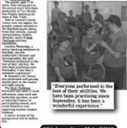
Whitehaven News, 29 April 2010